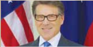
THANK YOU GOV. RICK PERRY VIP RECEPTION