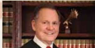
JUDGE ROY MOORE Chief Justice of Alabama Defender of Biblical values & traditional marriage

To help with our important cause together, please consider sponsorship levels, reserving a table, or planning to join us. Sign up here: texaseagleforumbanquet2016.eventbrite.com