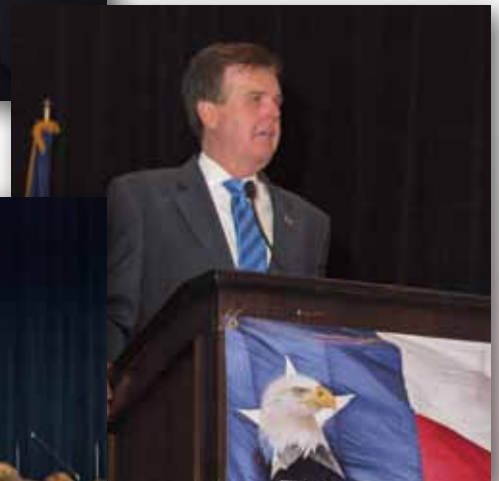
Texas Lieutenant Governor-elect Dan Patrick addresses the crowd.