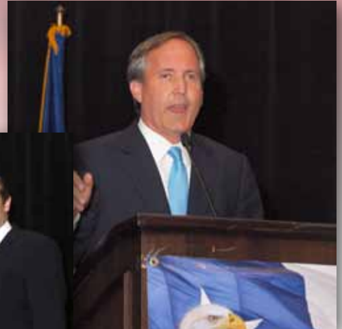
Texas Attorney General-elect Ken Paxton.