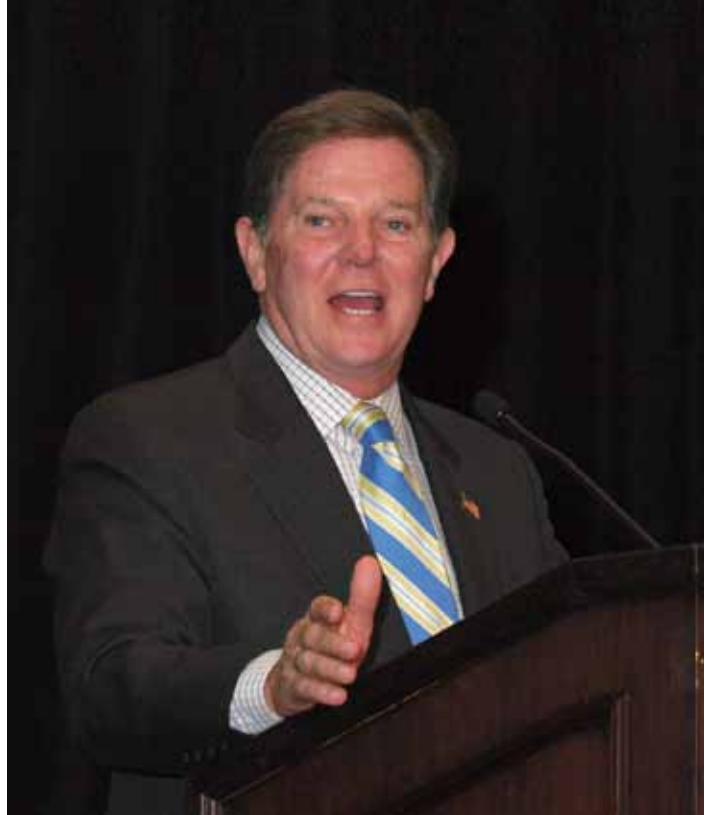
Former Majority Leader of the House Tom DeLay