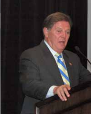
Former House Majority Leader Tom DeLay revs up the crowd!